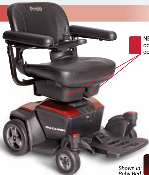
Shown in: Ruby Red

GET OUT THERE IN STYLE WITH THE ALL-NEW GO-CHAIR