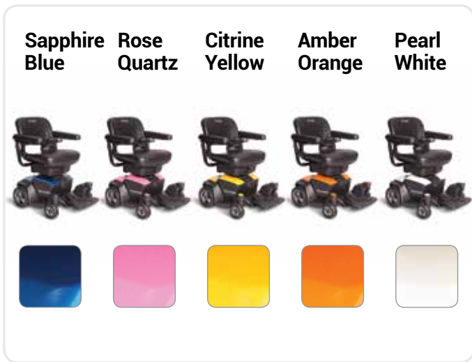
Variety of color options